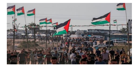
Figure 3 shows the transactional action process of Palestinians. From the picture, a group Palestinians are determined as the actors and the Palestinian flags are the goals. The angle of hands that is holding the flag form a strong vector. The action happens out near the fence along the border with Israel in the eastern Gaza Strip. It describes that they hold a demonstration to Israeli. Demonstration is an action to show their disagreement towards Israeli. By raising the flags, they proclaim that Palestine also has right to be free.

The results demonstrate that media attempt to depict Israelis and Palestinian differently through the choice of transitivity and images. In transitivity analysis, this study Wang's (2017) research that the negative actions are framed in binary fashions, Self and Other. The media mostly use negative material process to depict the case however those process have different functions based on the agent of the action. The negative actions used by Self-group that refers to Palestinians (in Datum 8) aims to show the action of self-defence by legitimizing their action whereas the ones used by Other-group that belongs to Israelis function to depict the offensiveness. The media also represent Palestinians as agent of victimization while Israelis as initiator of violent action. Therefore, this result attempts to add Rababah & Hamdan (2019) statement that the active agent in material process is used to