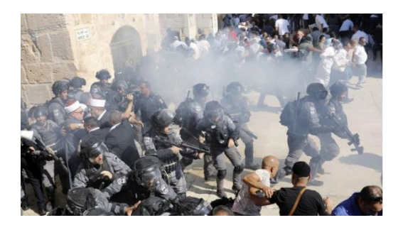
Figure 2 Daily Sabah 11/8/2019

Another picture that indicates victimization is shown in Figure 2. This picture contains the action process of Israeli police. It includes the police as the actor, the Palestinian as the goal of action, and the extended hands with holding the gun is the vector. This structure refers to a transactional action process in which the police together have the role of 'Actor' (Kress & van Leeuwen, 2006). The picture explains that the police as shooter who are shooting the Muslim worshippers or Palestinian in front of the mosque in order not to enter the mosque. It implies that news media represent the Palestinian as victims of the conflict whereas Israelis as the perpetrators.