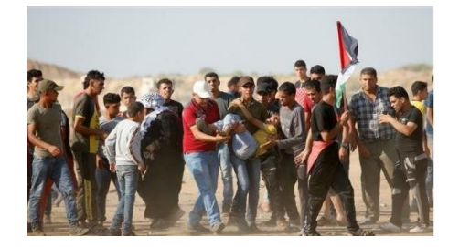
Figure 1 depicts a group of people is busy for helping the man who carry the injured boy. It belongs to reactional process in which the vector is formed by the direction